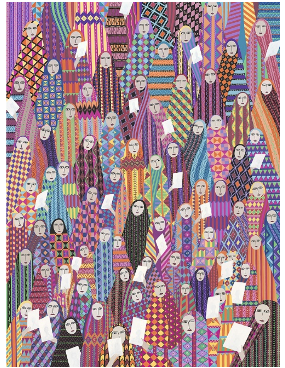
Helen Zughaib, Generations Lost.