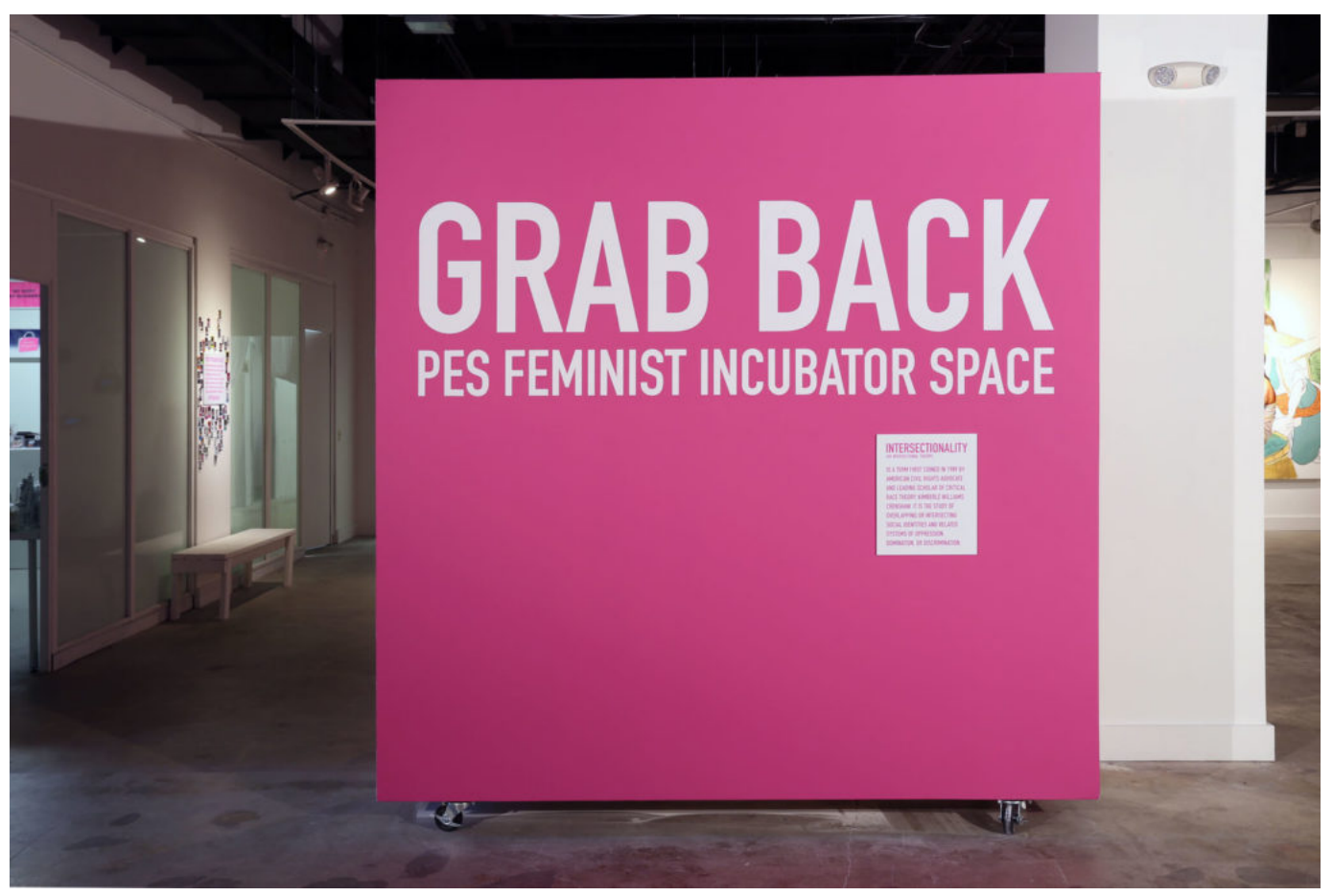
Grab Back installation view.