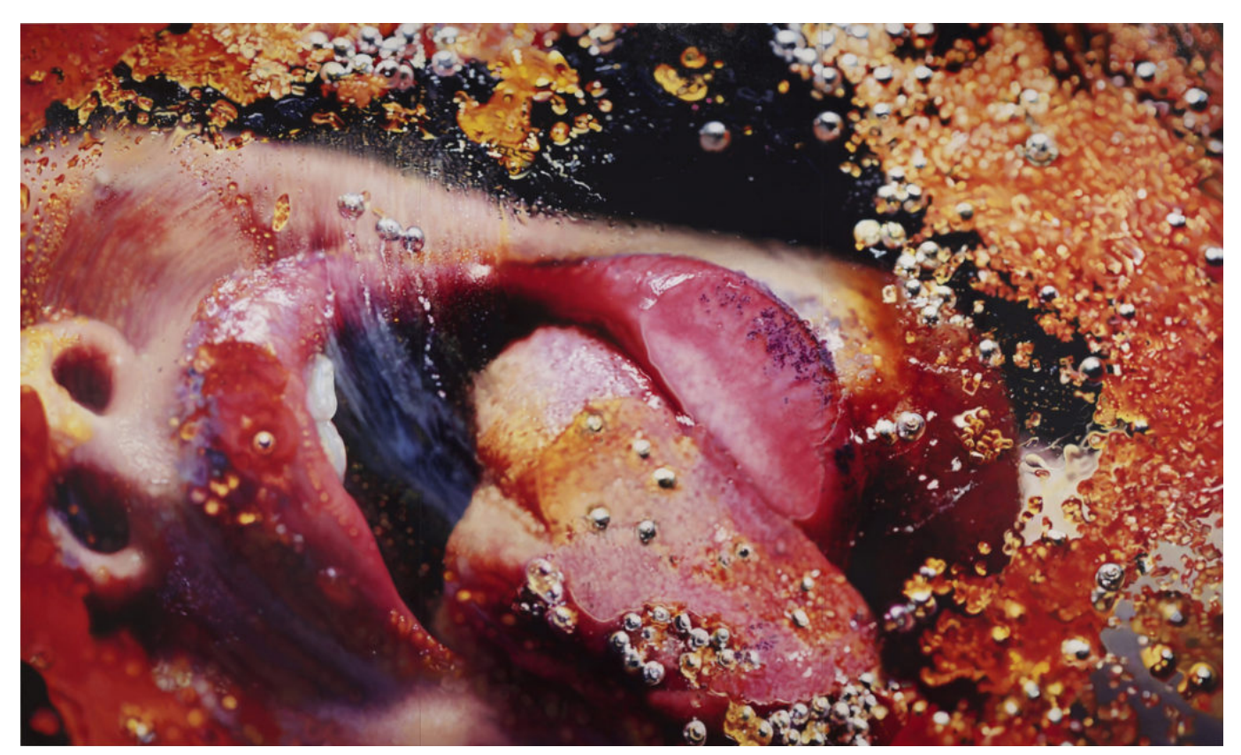
Marilyn Minter Orange Crush (2009).