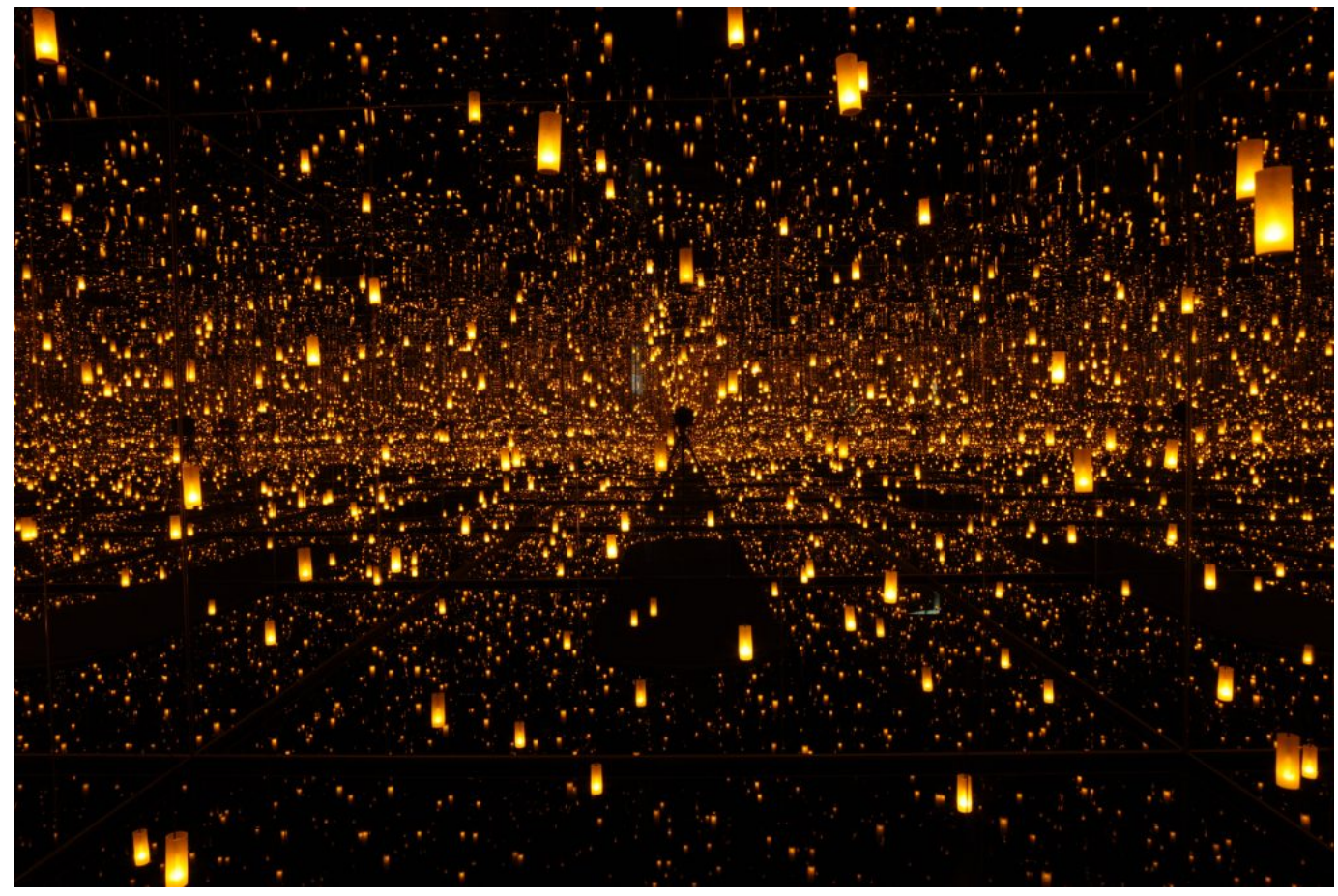
Yayoi Kusama's Aftermath of Obliteration of Eternity.