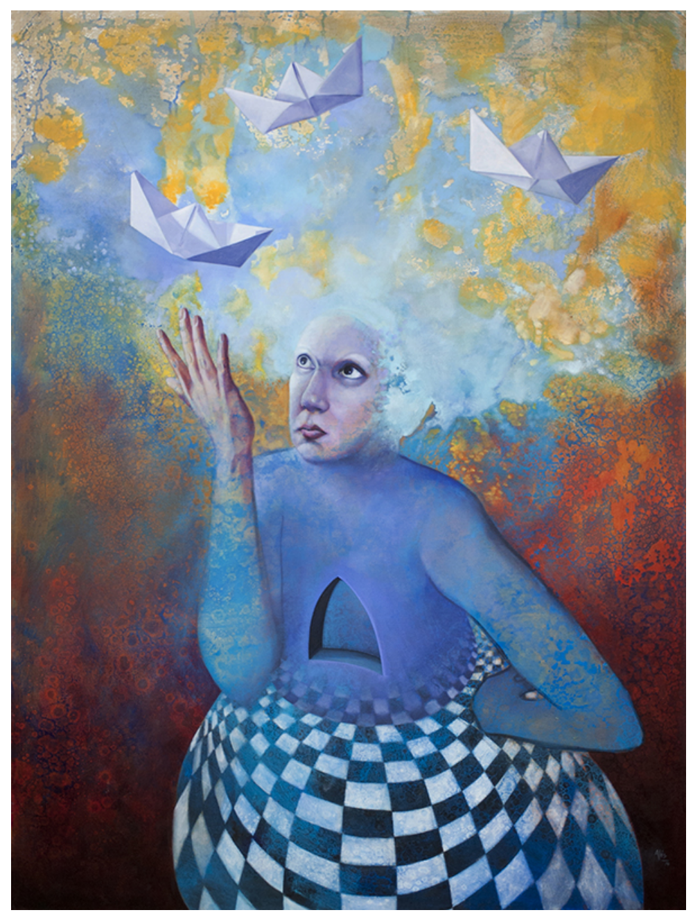
Angela Alés, Manifestation, 2014.