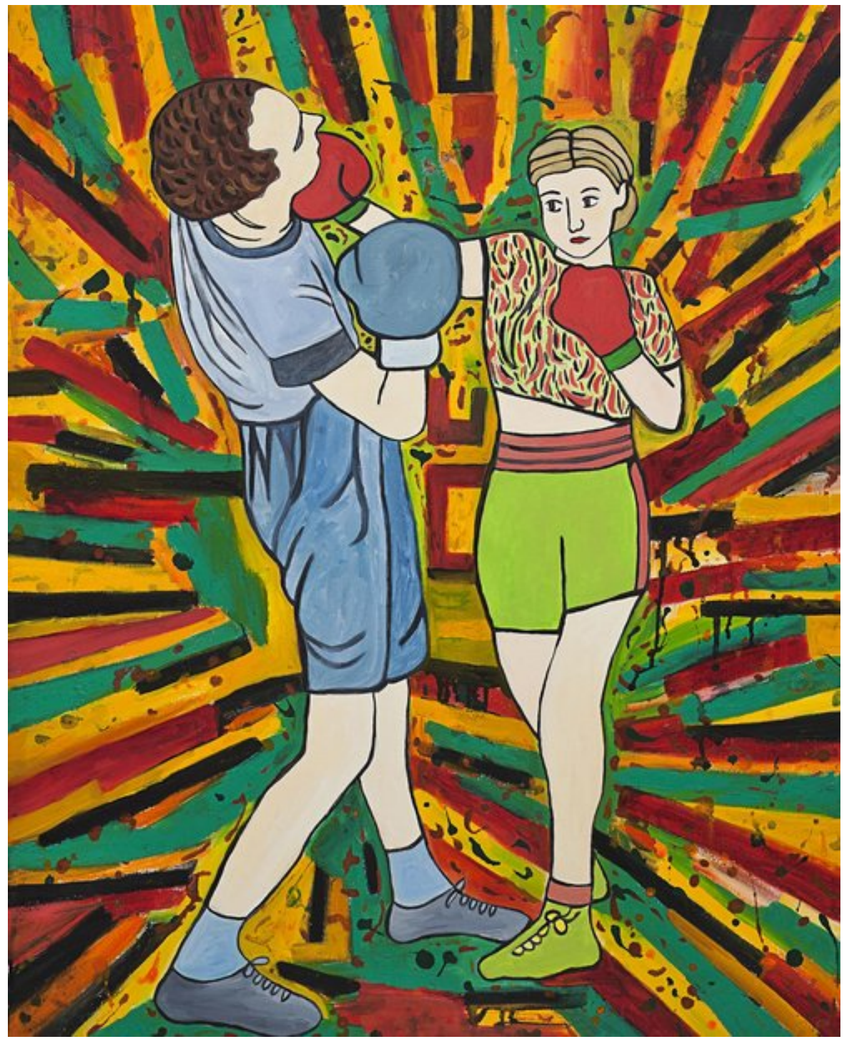
Susan Bee, Pow! (2014).