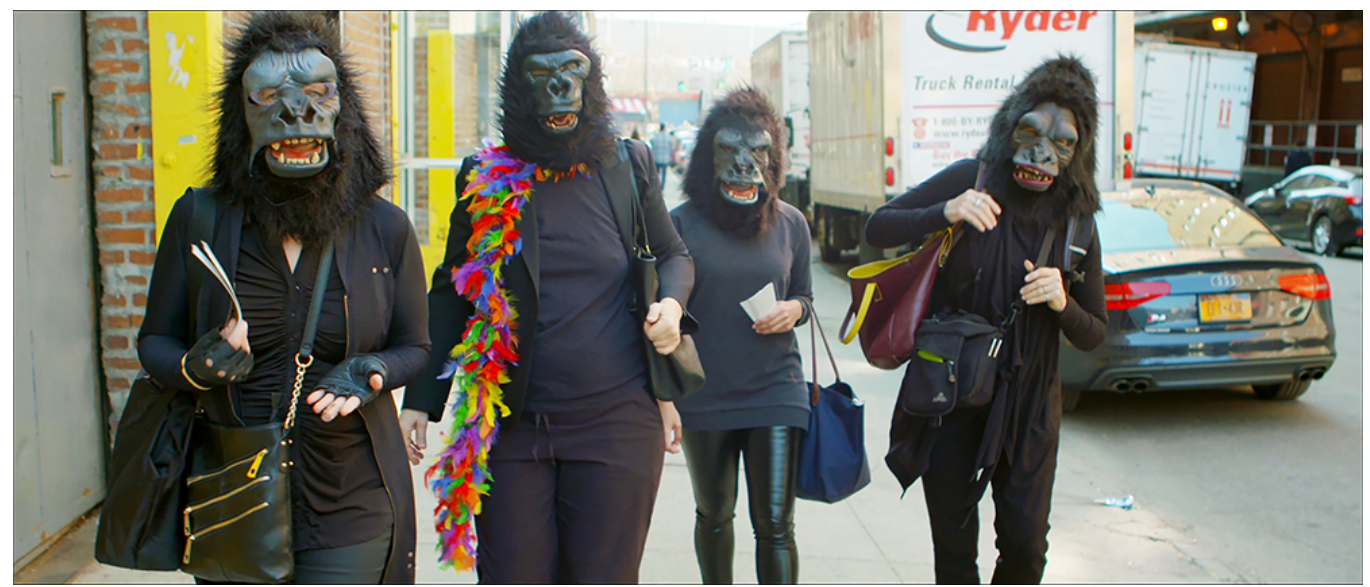
The Guerrilla Girls are known for wearing gorilla masks.