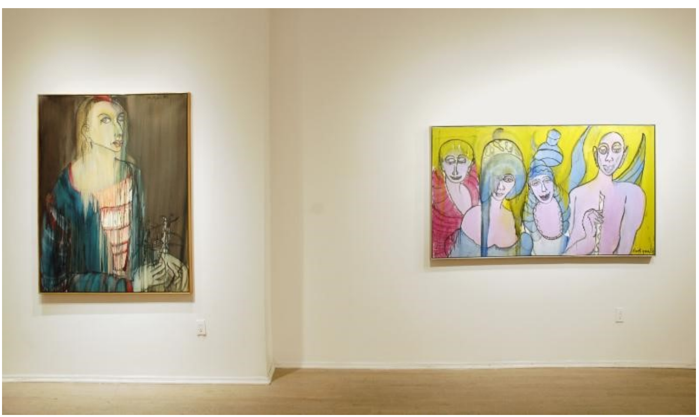
Installation view of Grace Hartigan: The Late Paintings .