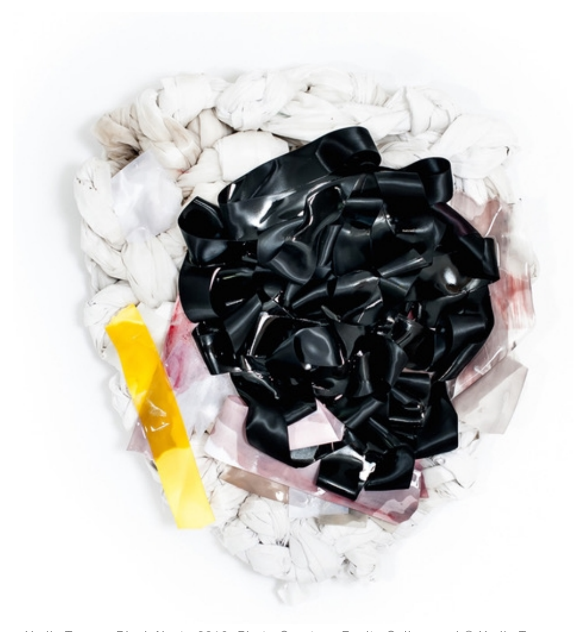
Vadis Turner, Black Nest, 2016. Photo Courtesy Equity Gallery and © Vadis Turner